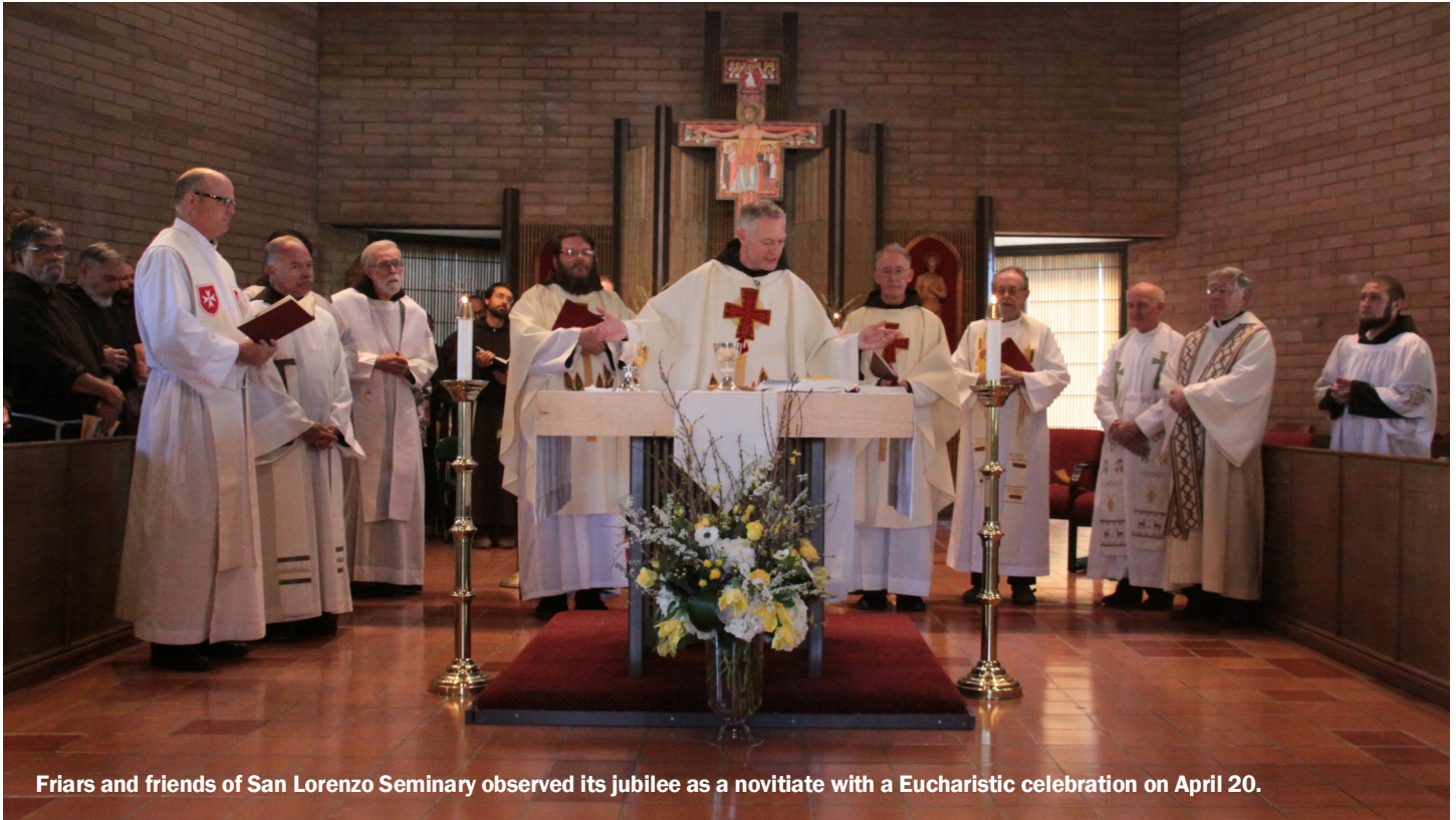
Friars and friends of San Lorenzo Seminary observed its jubilee as a novitiate with a Eucharistic celebration on April 20.