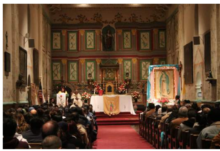
The novices celebrated Our Lady of Guadalupe with Old Mission Santa Ynez!