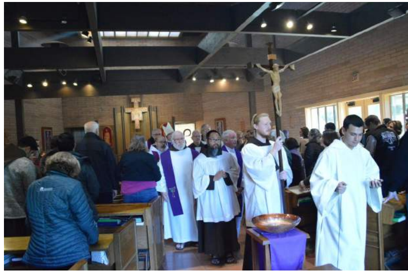
Bishop Robert Barron came to San Lorenzo for Mass on the last Sunday of Advent.